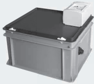
Neutralizer mm 700 x 400 x H 320